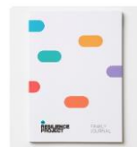
FAMILY WELLBEING JOURNAL