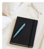
6 MONTH WELLBEING JOURNAL