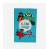
GEM CONVERSATION CARDS