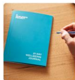
21 DAY WELLBEING JOURNAL