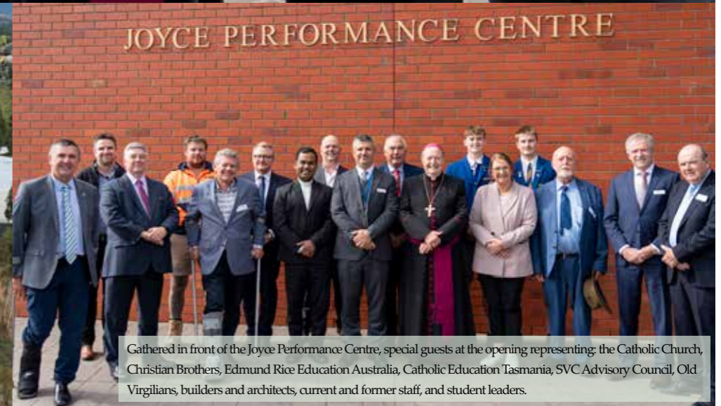
Gathered in front of the Joyce Performance Centre, special guests at the opening representing: the Catholic Church, Christian Brothers, Edmund Rice Education Australia, Catholic Education Tasmania, SVC Advisory Council, Old Virgilians, builders and architects, current and former staff, and student leaders.