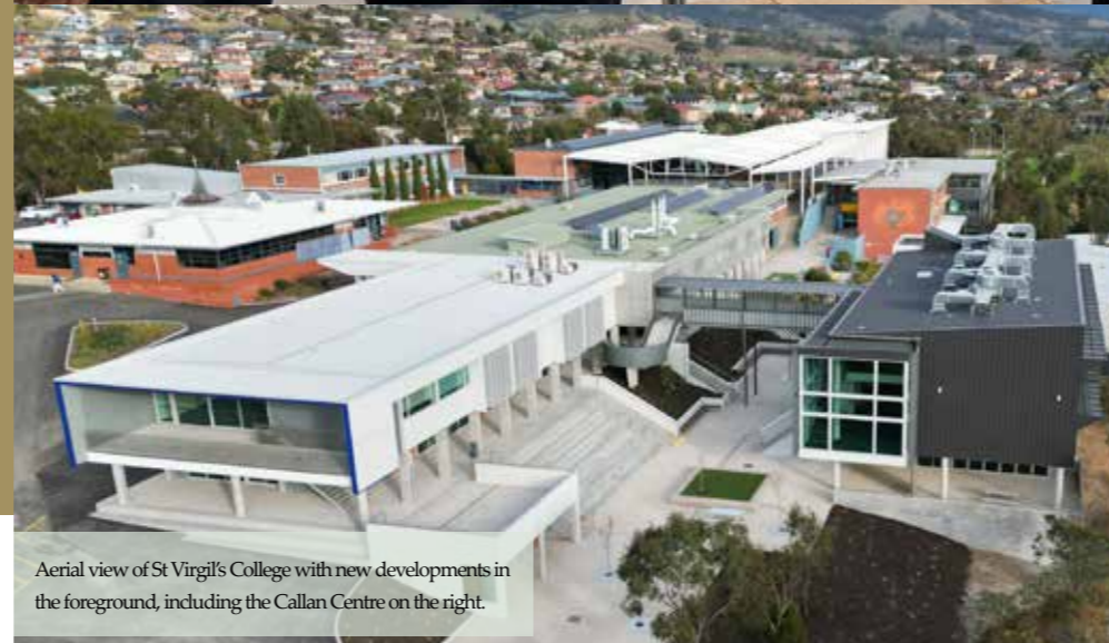
Aerial view of St Virgil's College with new developments in the foreground, including the Callan Centre on the right.