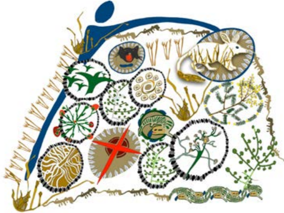
Student representation of the Austins Ferry property, featuring the local flora and fauna and the Charter Touchstones.

We acknowledge the continuing relationship of Aboriginal and Torres Strait Islander peoples to Country that was never ceded and commit ourselves to the ongoing journey of Reconciliation.