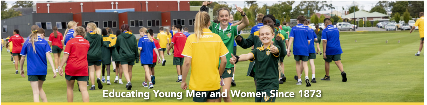
Educating Young Men and Women Since 1873