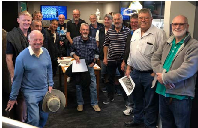
Above: 1973 Peer Group - 50 Year Reunion – 4 November 2023