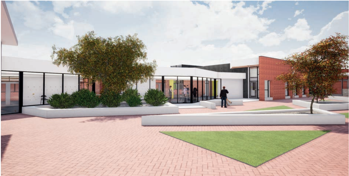
Brady Wing Courtyard Development Draft