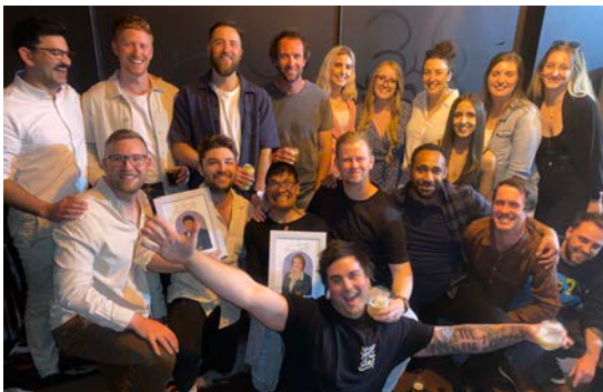
2012 Peer Group 10 Year Reunion, Kingsway Bar – 5 Nov 2022