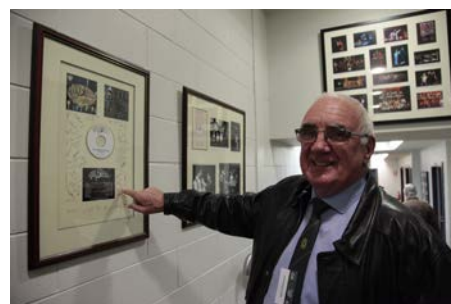
1958-62 SPC Prospect 55 Years Reunion – 25 May 2019