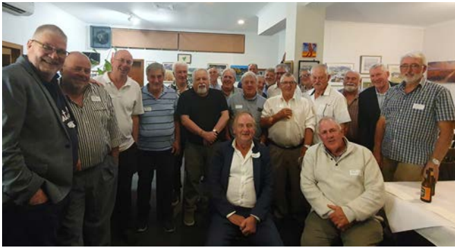
Above: 1970 Year 10 Green & Gold Reunion – 11 March 2023