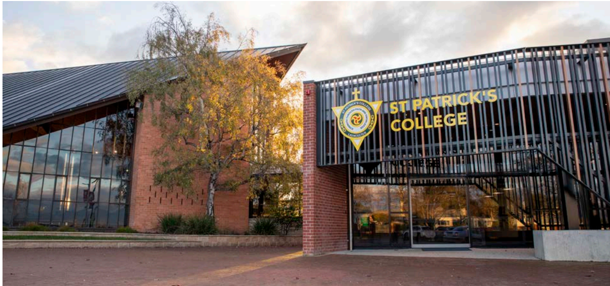
New College Entrance – 2022