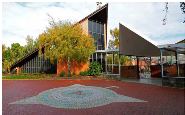
Chapel and College Entrance – Pre Renovations

after the completion of the Administration Building, as the two areas are directly linked. The Brady Wing was completed in time for the start of Term 3 2020, and has been warmly welcomed by staff and students.