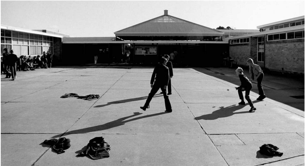
Above: Middle Quadrangle – Downball