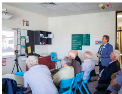
1958 SPC Prospect Foundation Classes Reunion – 17 March 2021