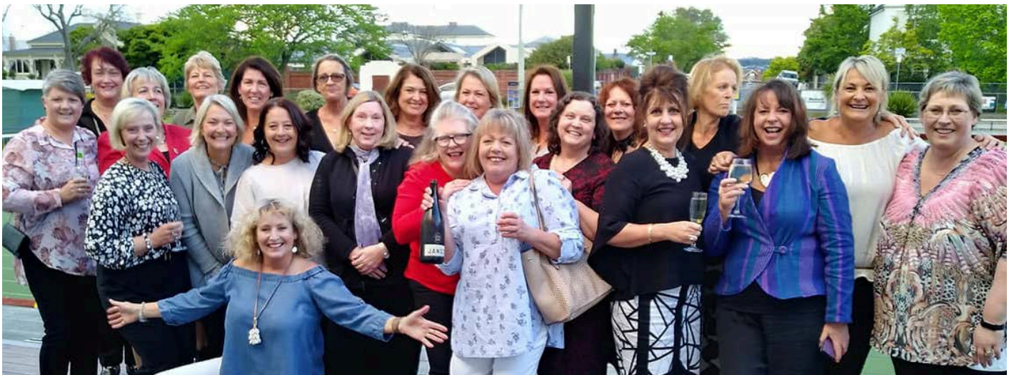
1979 Year 10 Marian College 40 Year Reunion – 26 Oct 2019