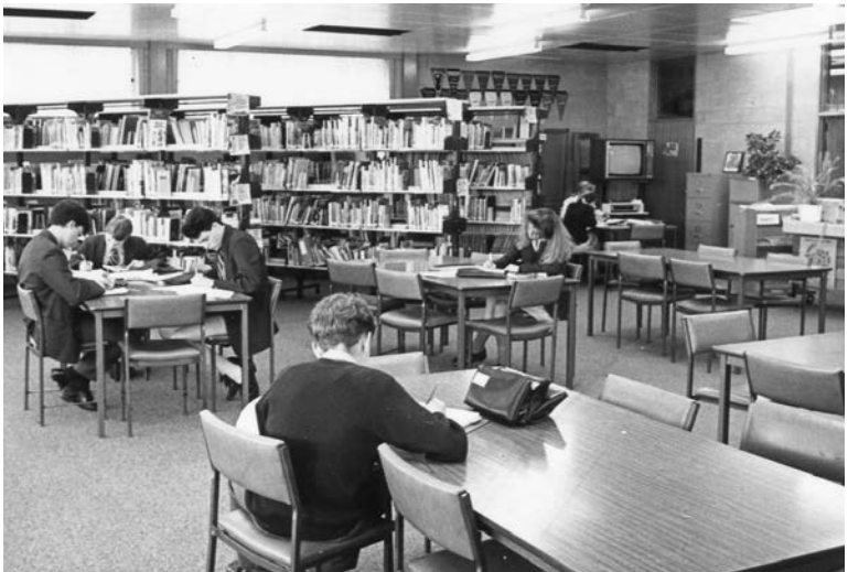
Above: Middle School Library – Marian Wing

With each milestone, from crest redesign to motto revision, the College progressed, positioned to embrace the challenges and opportunities to come.