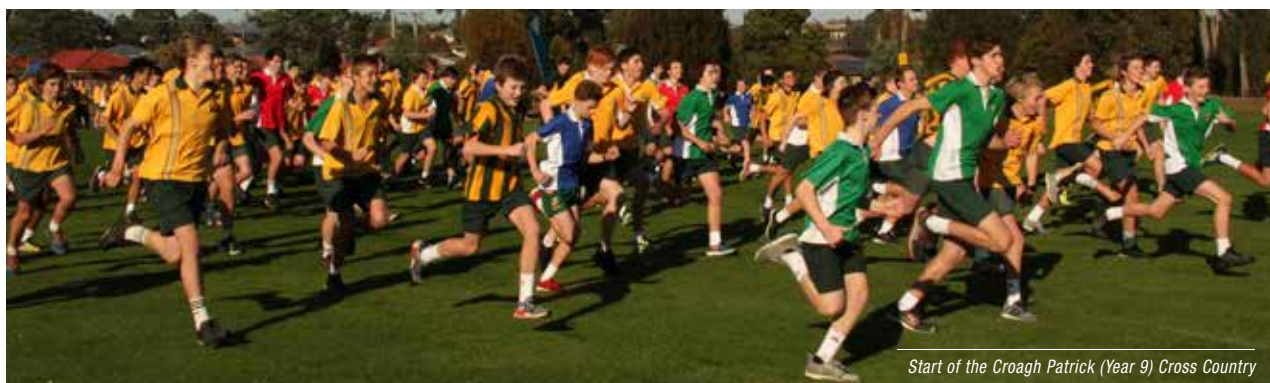
Start of the Croagh Patrick (Year 9) Cross Country