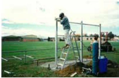
1996 Scoreboard Beginnings