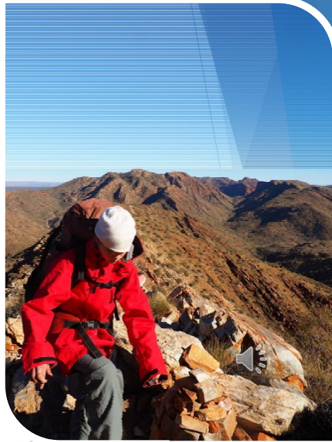
Image taken on top of Razorback Ridge. A challenging day, generally starting early in the morning, in the dark for lead groups, with breakfast up on the ridge. Breathtaking views.

Varying activities and expedition style program