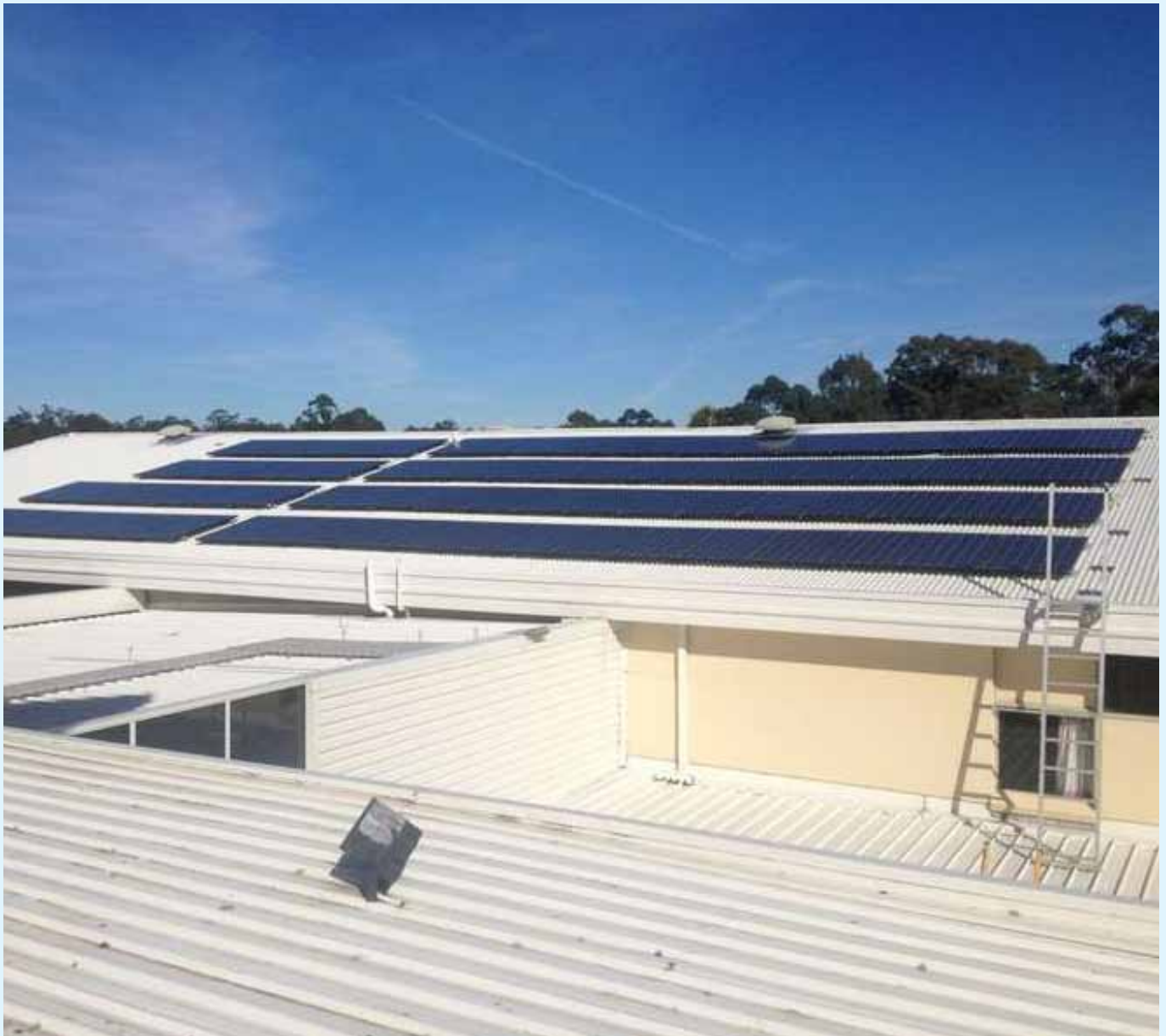
The solar panels on the roof of Benildus Hall.