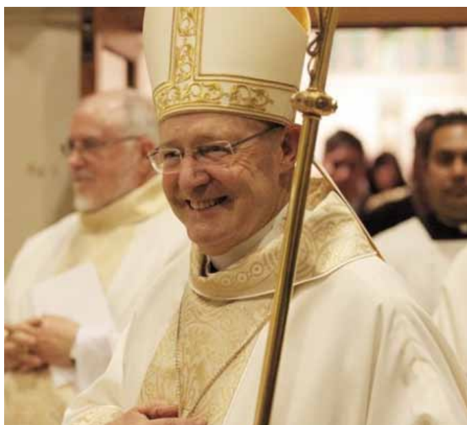
The new Archbishop of Hobart.

The Archbishop also said he believed that the Church needed to have a strong presence in the various forms of social media in order to remain connected to people across the planet. "The last World Youth Day was eloquent testimony to the fact that basic presentation of the Christian message attracts and inspires young people," Archbishop Porteous said. "And it's very important that the Church be present in those very new forms of media because they are also the point of contact for many young people."