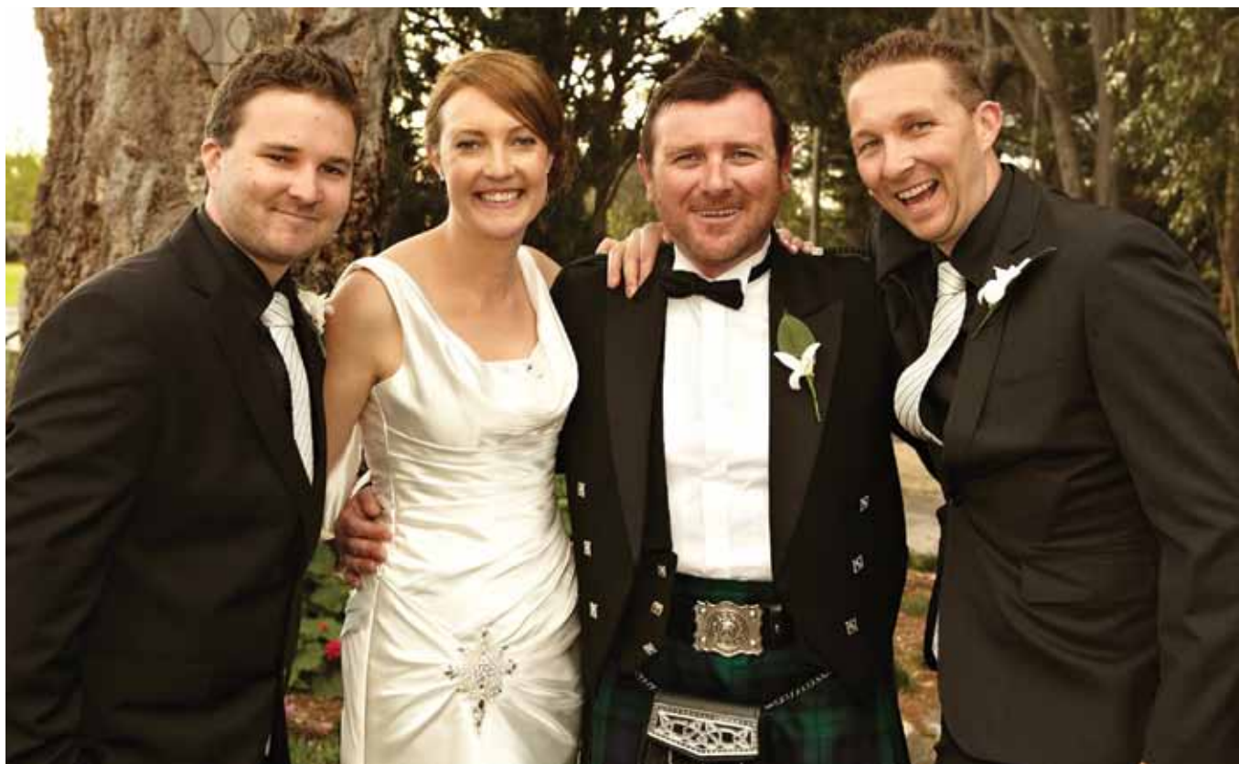
A Scottish wedding.