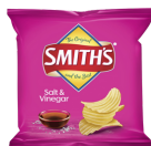
Salt & Vinegar $1