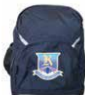
school bag (junior)