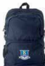
school bag (senior)