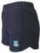
sport shorts (with inner)