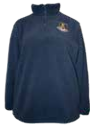
polar fleece top