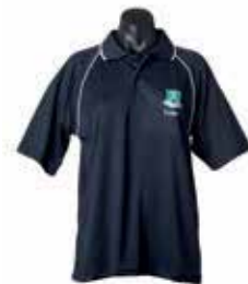
year 9 polo