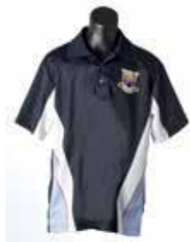
short sleeve polo