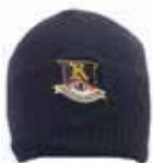
beanie (ELC to year 12)