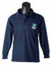
long sleeve polo