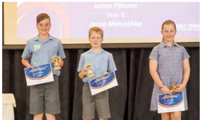
Junior School Academic Awards