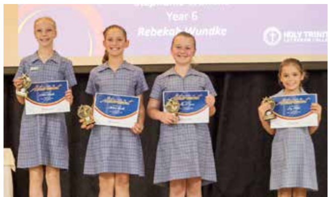
Junior School Service Awards