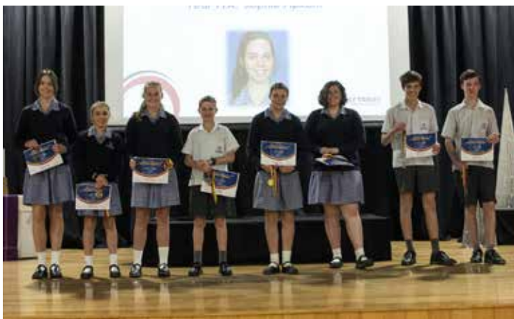
Spirit of Holy Trinity