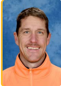
Mr Tim Scott