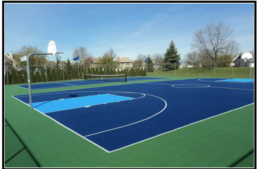
Indicative image only

2026 contributions to the 'Building Fund' will be utilised in the planned redevelopment of the existing soccer space at the front of the gym. Once the new junior education centre is complete, the area between the building and the gym will be developed into a sports precinct, with plans for all weather playing surface basketball and netball courts, along with seating and landscaping. Once complete, this space will be used for sport lessons, lunchtime and recess play and after hours and weekend public use. Ultimately, we are planning for the courts and seating to be undercover.