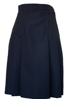
Pleat Skirt Navy