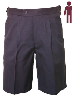
Shorts Pleated Navy