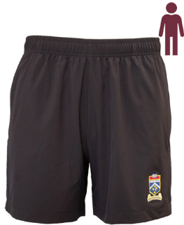
Sport Shorts Unisex