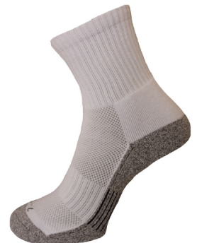
Sport Socks 2 pkt