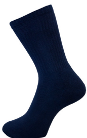
Socks Navy Crew 3 pkt