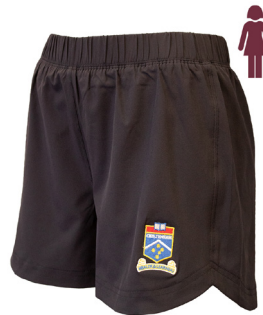
Sport Shorts with Inner