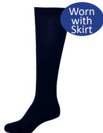
Socks Knee High Navy