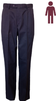
Trousers pleated Navy