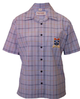
Blouse Short Sleeve