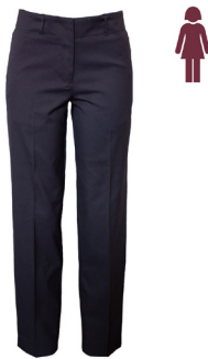
Pants Tailored Navy