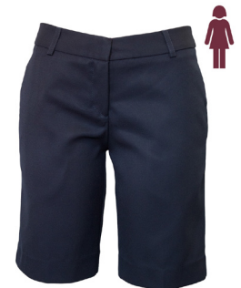
Shorts Tailored Navy