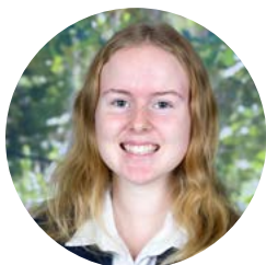
GRACE H TEN BOOM