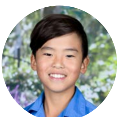
HEROCK K TEN BOOM