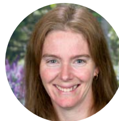
AMANDA DRAIN EXTENSION & ENRICHMENT