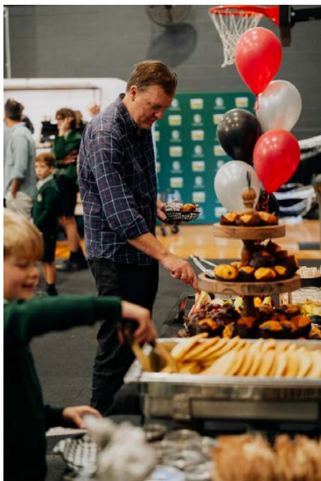
Dad's Diner 2025