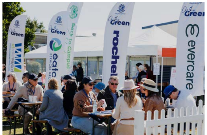
Dedicated Sponsor Areas - On the Green 2025