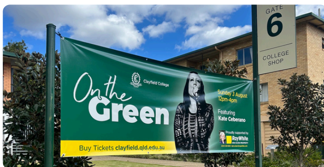
On the Green Bayview Terrace signage 2025