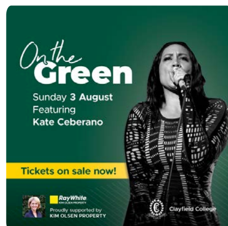
On the Green Digital Creative example 2025