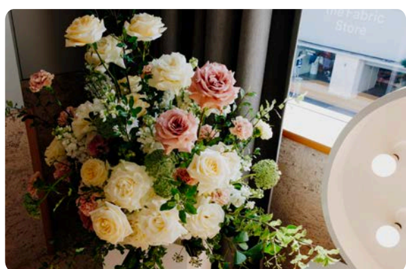
Luminous Lunch, The Calile Hotel, 2025