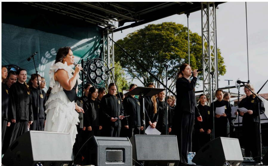
Kate Ceberano performing with Clayfield Music Students at On the Green 2025

On the Green is Clayfield College's flagship annual outdoor event, held on the Main Oval and open to the public. Featuring live music from professional, student, and community artists, along with a variety of food and beverages, it offers a relaxed, family-friendly atmosphere. The event also serves as the College's 'Back to Campus Celebration' for Old Collegians.