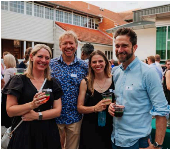
P&F Welcome Night 2025