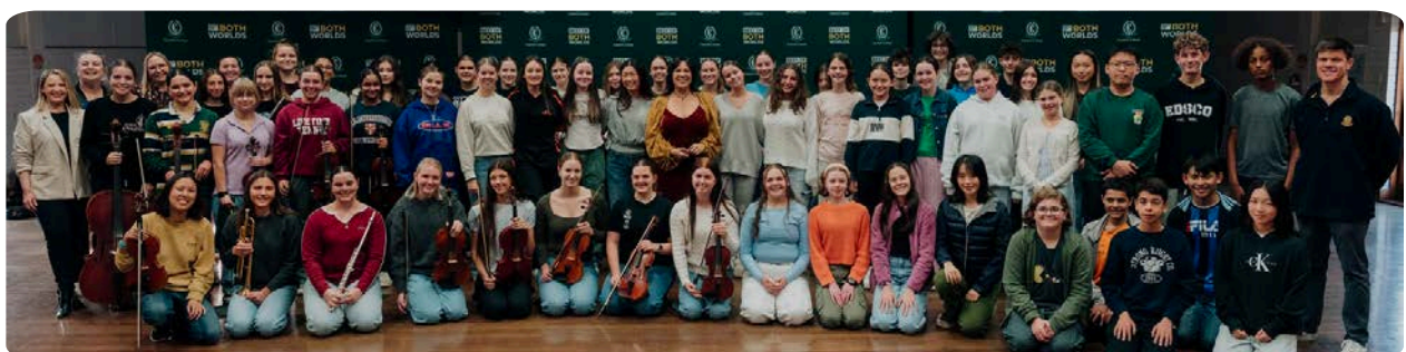
Student workshop with Kate Ceberano 2025