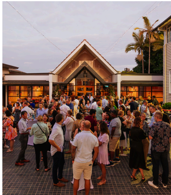
P&F Welcome Night 2025