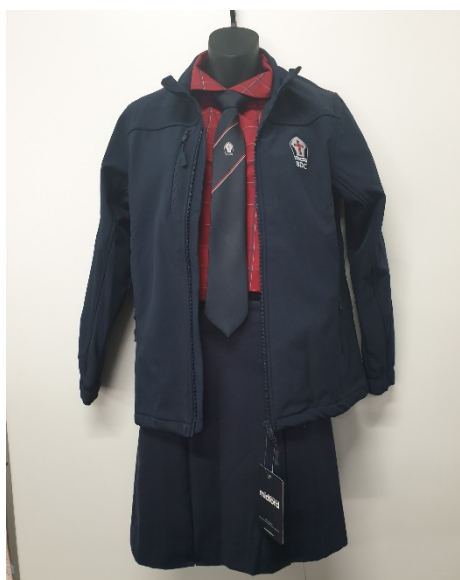
Years 7-9 soft-shell jacket with skirt.