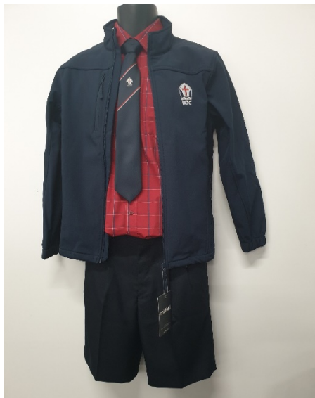
Years 7-9 soft-shell jacket with shorts.

Contact: 6651 5644 ext. 238 or email bishop.druitt@midford.com.au