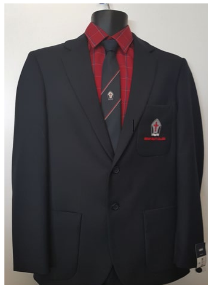
Blazer is an option for Years 7-9.